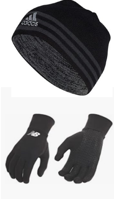
Synthetic cap, gloves