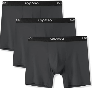
Quick Dry underwear