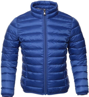
(inexpensive) down jacket