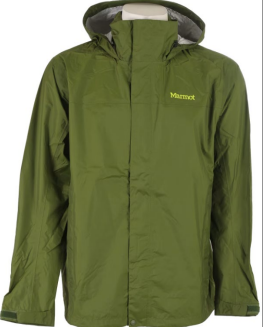
Rain jacket (quality)