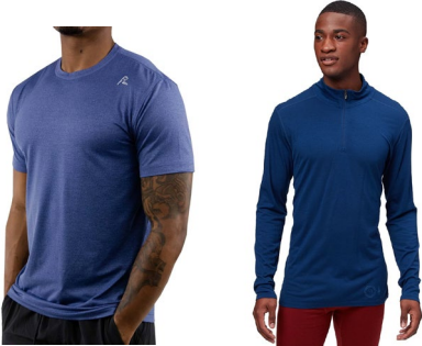
Quick Dry Shirt S/S and L/S