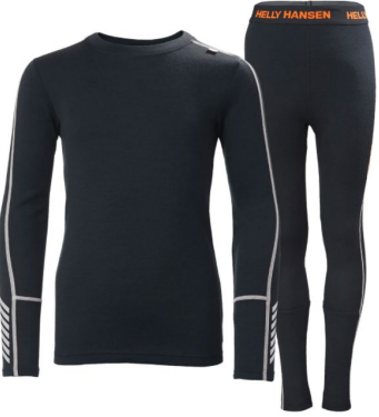
Wool/poly blend baselayer