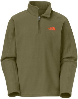
¼ zip pullover fleece