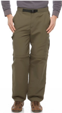
Convertible pants nylon